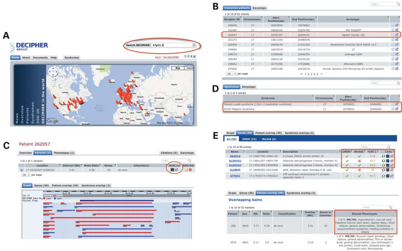
Figure 2. Search and analysis. (A) DECIPHER provides a simple search interface that supports many different types of queries (highlighted: search DECIPHER by chromosomal position 17p11.2). (B) List of overlapping DECIPHER patients with additional detail and annotated syndromes found matching query. (C) DECIPHER patient page showing variant detail (position, mean ratio, genes involved and inheritance), with external genome browser links (highlighted). Also shown is a graphical comparison of patient CNV overlaid on other DECIPHER patients having an overlapping variant. (D) DECIPHER Gene Data: description for every gene affected by the CNV, additional data including Online Mendelian Inheritance in man (OMIM), OMIM Morbid, and Haploinsufficiency Scores and external links to gene resources (highlighted). (E) DECIPHER Patient Overlap: other consented DECIPHER patients that have an overlapping CNV with the query patient, common phenotypes are shown in bold.

to individuals seeking to undertake large-scale analysis. These bulk data have been used to catalyse research into improved interpretative tools, most notably in the prediction of haploinsufficiency (42), mouse–human phenotype association studies (33) and the characterization of copy-number stable regions in the human genome (43).